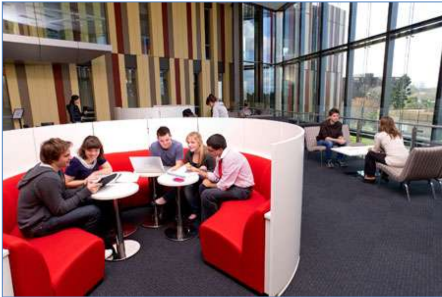
Macquarie University Study Space

Automated storage & retrieval system for print books