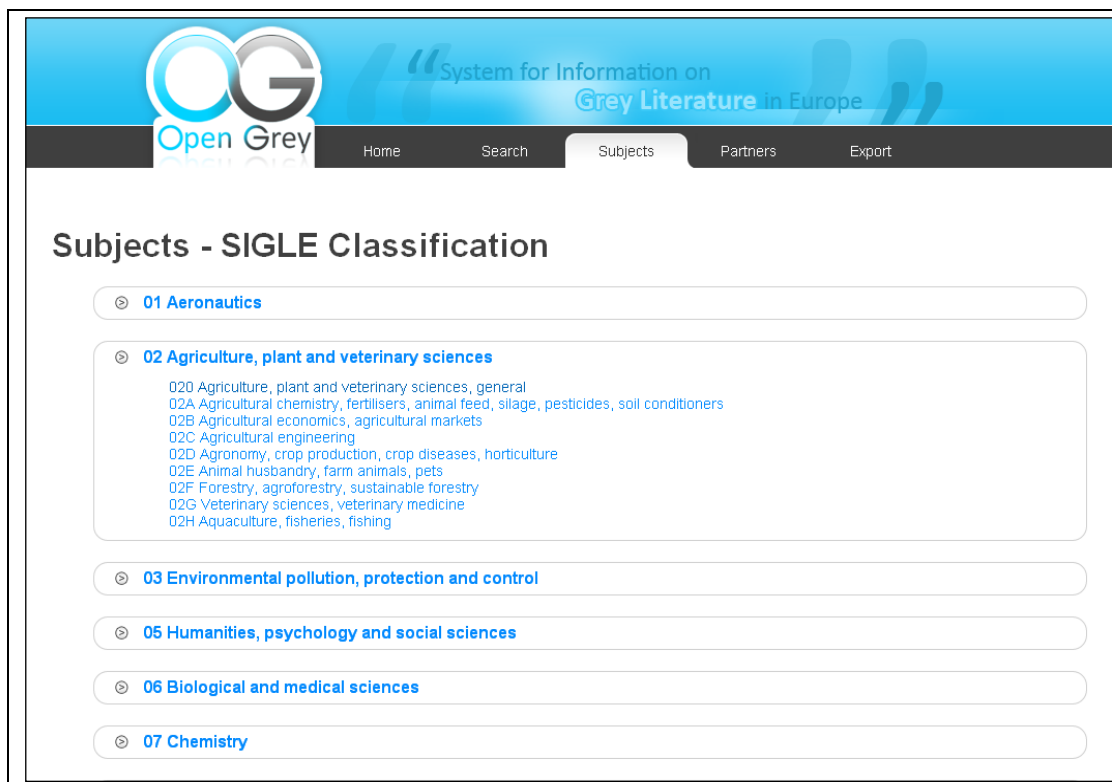
Figure 32: OpenGrey subject

List of partners contains general information about the organization, information on how to obtain a copy from old SIGLE records and links to grey literature repositories or projects in the country.