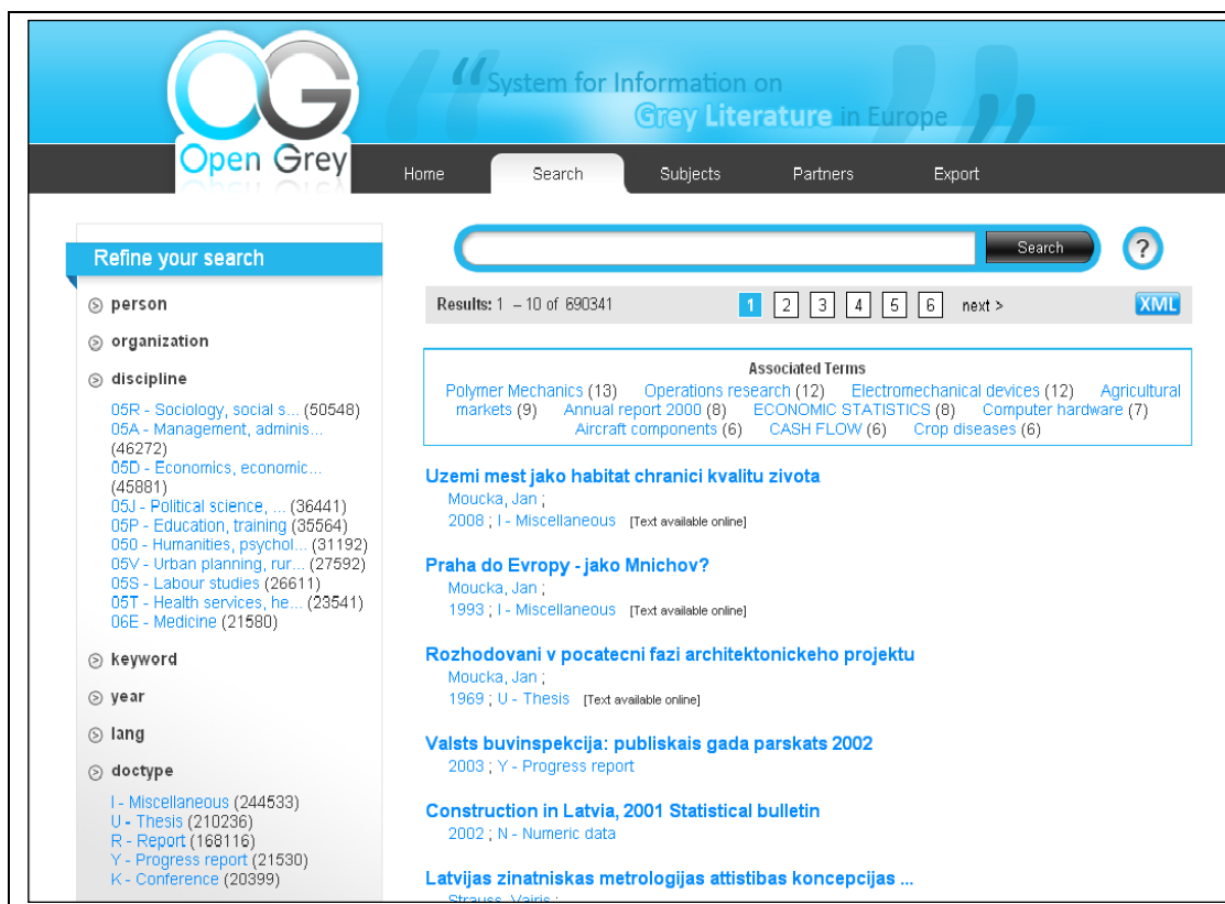
Figure 32: OpenGrey search

“Basic search in OpenGrey is done in a Google-like field. Exalead offers the possibility to refine the results through faceted search. The new criteria are added to the query field and the search strategy can be copied and saved. The indexes chosen for refinements (such as author, subject, date, language...) are similar those of the Czech repository NUSL/NRGL 2 .” (Stock, 2011)