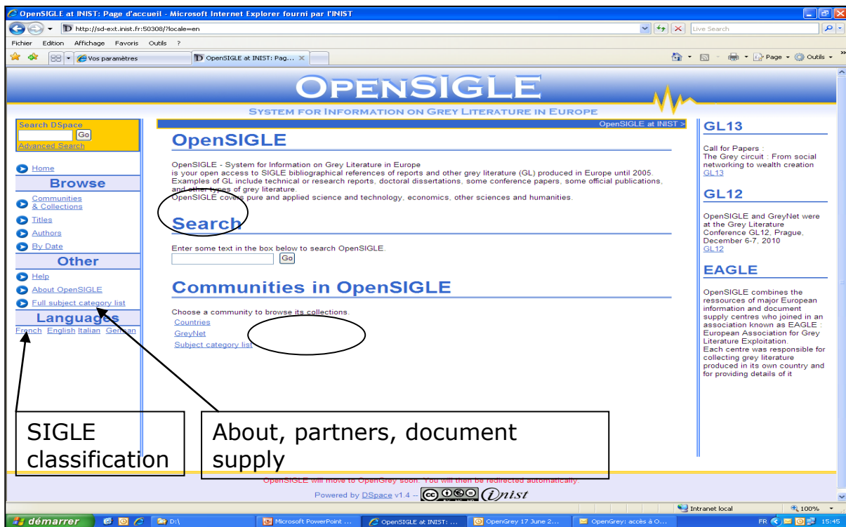
Figure 1: OpenSIGLE homepage

With the goal to improve the access to information on document supply through the general layout, improved record display and additional links and re-open OpenSIGLE for “new” input and close the gap between SIGLE and today INIST-CNRS decided to move OpenSIGLE to a new platform and new technology.