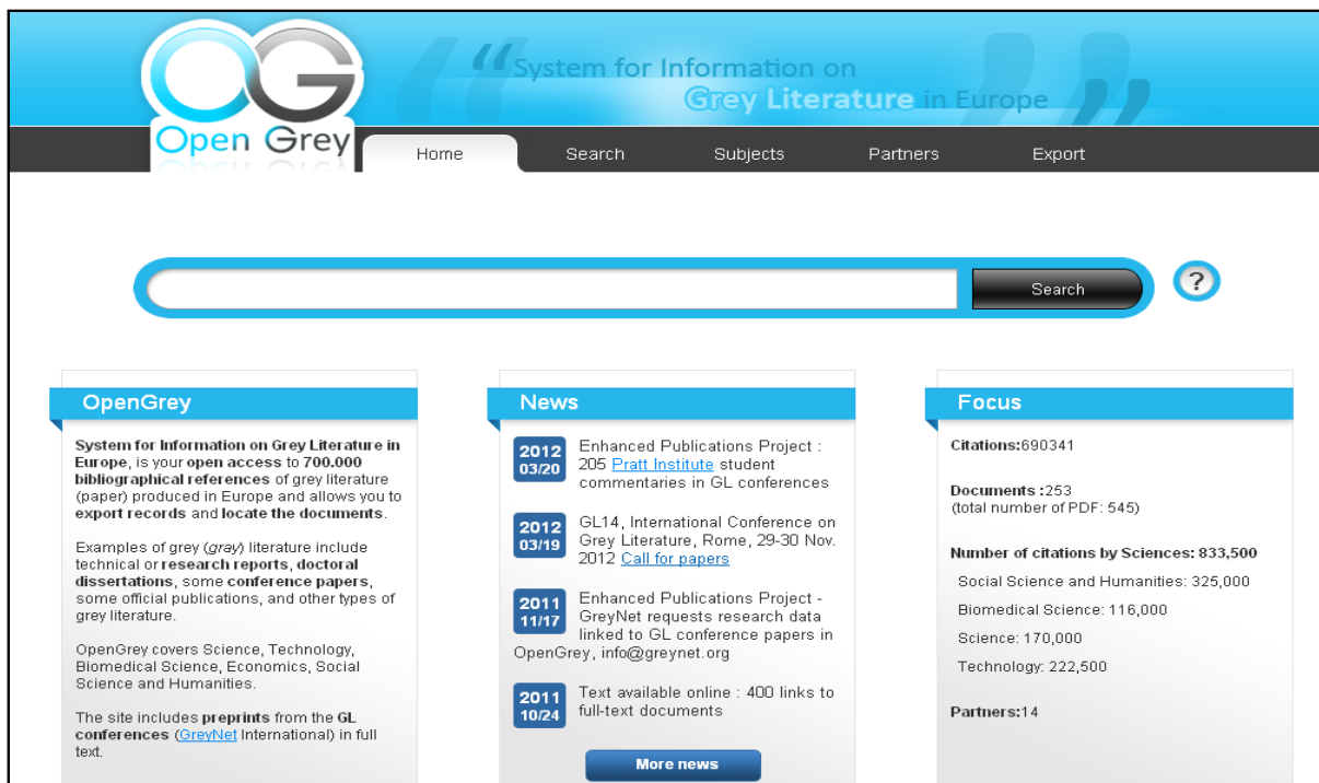
Figure 2: OpenGrey homepage

The new solution provides requested improvements for building grey literature content. The most important features are tools for adding records from 2005 onwards from current partners, opening of the database to new European partners and links to digital documents for existing records.